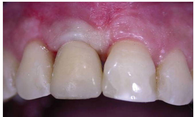
Figure 2. Presence of "black holes" due to the absence of papillae.