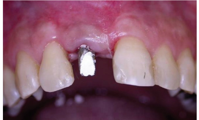
Figure 1. Absence of gingival papilla after the placement of the prosthetic pillar.

For the purposes of carrying out the clinical procedures, all the ethical principles contained in the Helsinki declaration (2000) were observed, as well as compliance with specific country legislation.