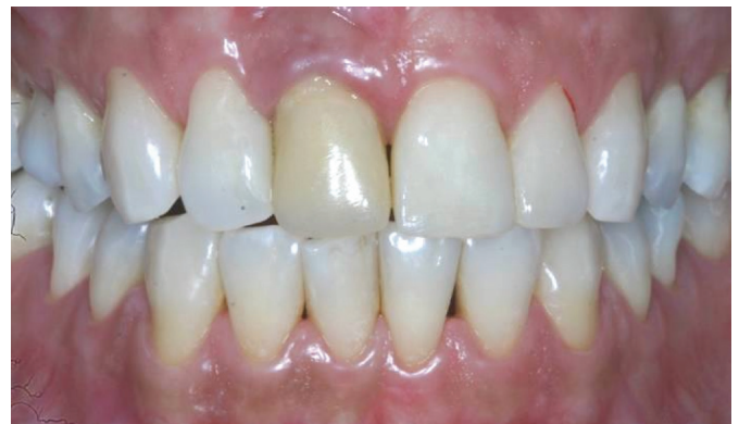
Figure 3. Gingival appearance after 3 months of conditioning.