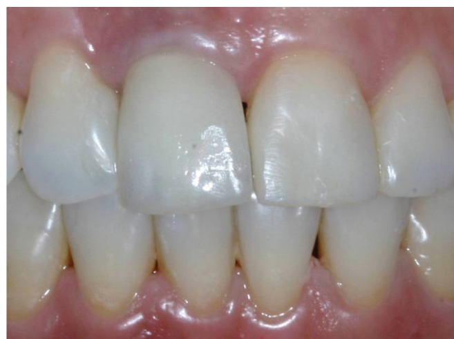
Figure 6. Esthetic obtained after cementation of the In-Ceram crown.