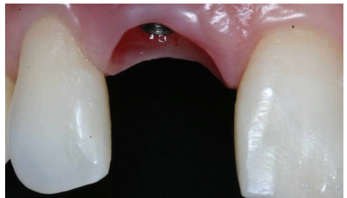
Figure 4. Rough view of gingival papillae obtained.