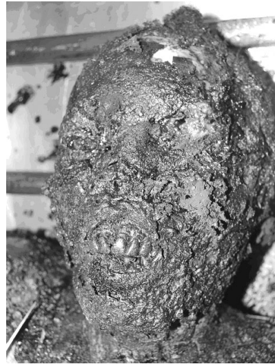
Figure 2. Detail of face of carbonized body IML-SP. (October, 2008).

of root canals) of tooth 16, submitted to necropulpectomy, according to the record chart sent (Figures 4 and 6) and coincidence with regard to the presence of restoration with temporary cement in tooth 27 of the cadaver, compatible with emergency endodontic treatment performed in the patient.