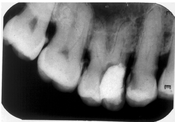
Figure 6. Radiograph taken at urgency service of Dental Teaching Institute (antemortem information).