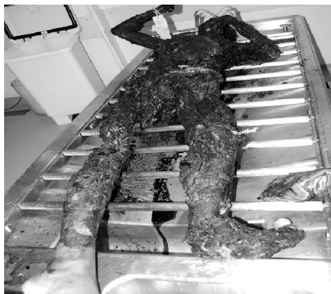
Figure 1. Carbonized Body IML-SP (October, 2008).

The radiographic image (Figure 4) emphasized the following peculiarities: The radiolucent area on the distal surface of the crown of tooth 15, compatible with caries; solution of continuity with loss of substance in the mesial cervical portion; positioning, coronal morphology, conformation of the pulp chamber and singular shape of the root canal (bifurcation of the canal as from the middle third of the root); radiolucent area, compatible with caries, on the mesial and occlusal surfaces of tooth 16, extending from the pulp chamber and cervical third of the root canals; solution of continuity with loss of substance in the cervical third of the distal root; positioning, anatomic conformation of the crown, roots and root canals; positioning, coronal morphology, conformation of the pulp chamber and root canals of element 17; positioning, anatomic conformation of the crown, roots and root canals; positioning, coronal morphology, conformation of the pulp chamber and root canals of element 18, presence of image compatible with calculus on the cervical portion of the mesial face of the crown; horizontal bone loss pattern, affecting elements 18, 17, 16 and 15; vertical bone loss pattern on the mesial interproximal surface of tooth 15 and adjacent, and anatomy of the maxillary sinus cortical (extension to alveolar area) and its relationship with the roots of the dental elements observed.