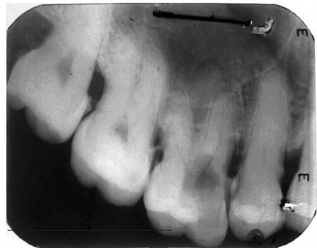
Figure 4. Radiograph taken at urgency service of Dental Teaching Institute (antemortem information).