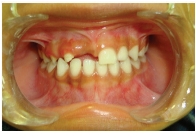
Figure 4. Picture of the histological cross-section of tooth 51, showing calcification of the pulp tissue and disorganized dentin.

In this case, no local or systemic factor was identified as having the possibility of a connection with the regional odontodysplasia. This very observation has also been made by other authors 4 . On the other hand, there are reports of cases which associate regional odontodysplasia with vascular nevus in the area of the affected teeth, which supports the most accepted etiology for the anomaly, namely the alteration in the vascularization in the area 15 .