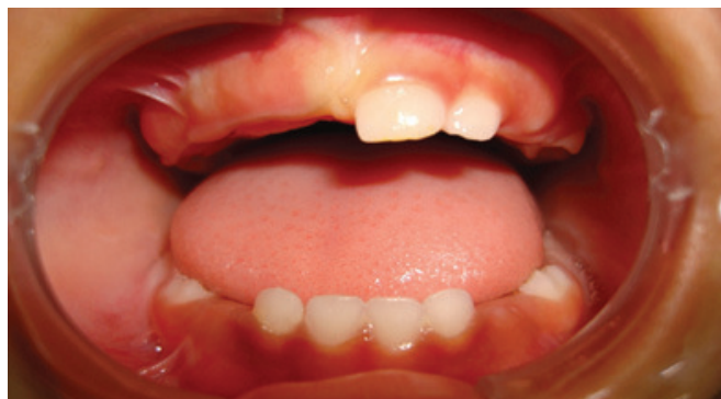
Figure 1. Front view of the patient at 18 months of age, showing the absence of teeth in the upper right quadrant.

The dental bridge, constructed using stock teeth and a vestibular retainer, took well in the patient, who will remain under supervision during the development of the dentitions (Figure 6).