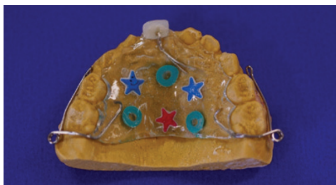
Figure 5. Front view of the patient at three and a half years of age showing the extrusion of the lower incisors.