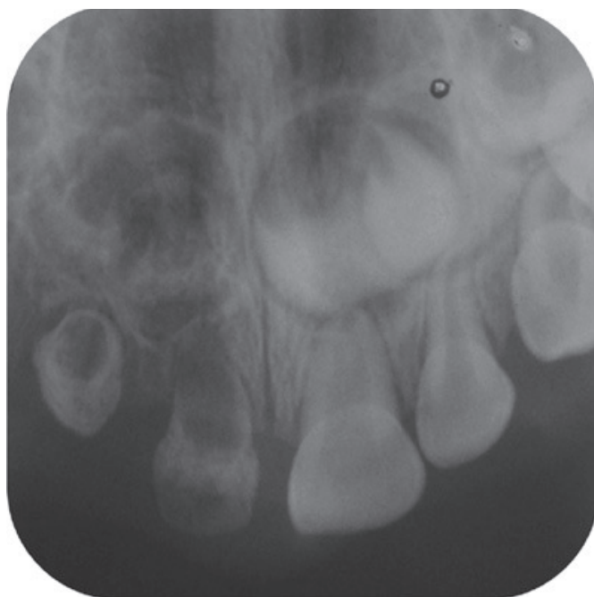
Figure 3. Periapical x-ray of the patient at the age of two and a half years, which confirms the diagnosis of regional odontodysplasia affecting the teeth in the upper right quadrant.