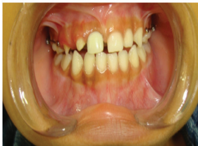
Figure 6. Front view of the patient at three and a half years of age after the insertion of the prosthetic appliance.