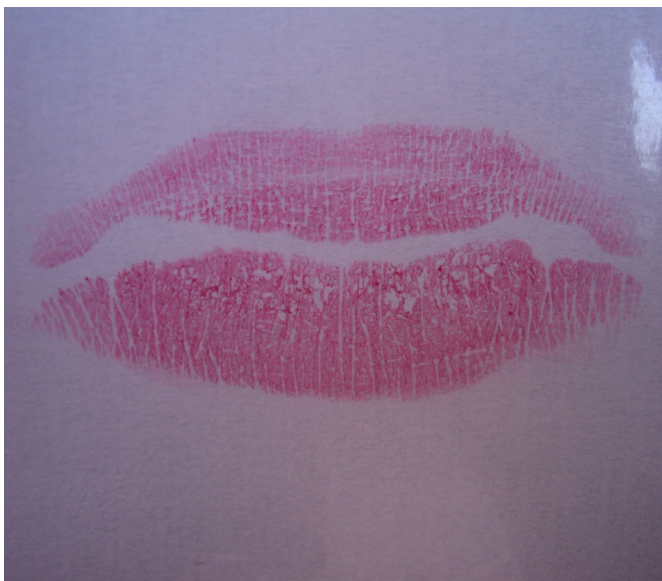
Figure 2. Lip print made on paper using lipstick.