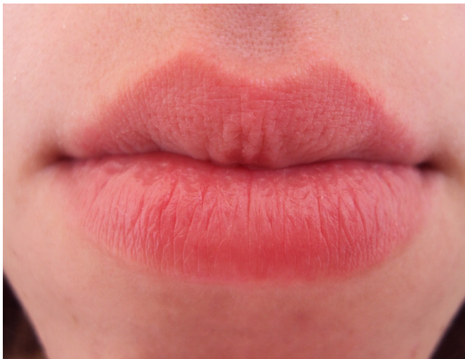
Figure 1. Photograph of lips (and lip lines).

Figures 1 and 2, below, show the lips (and lip lines) and lip print of the same individual. Figure 3 illustrates various types of lip grooves in the same individual, according to the Suzuki & Tsuchihashi classification 3 .