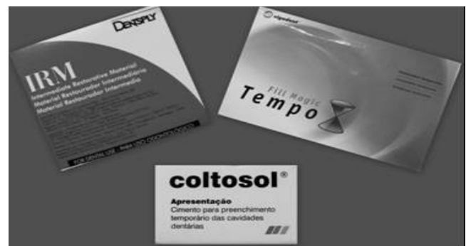
Figure 1. Materials tested.