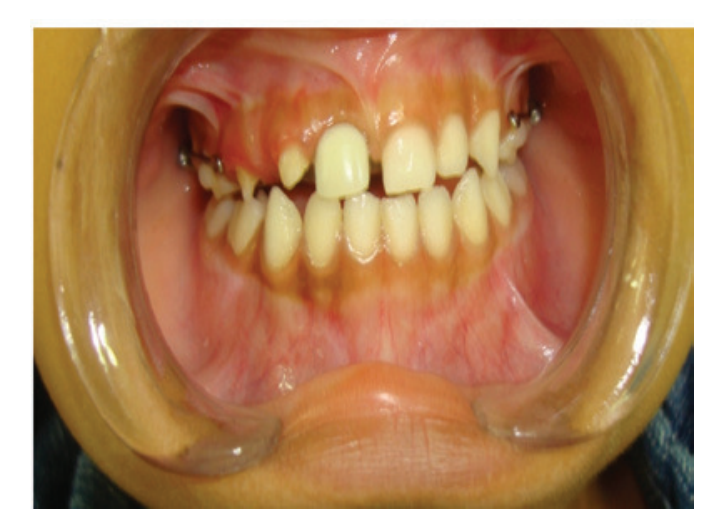
Figure 6. Front view of the patient at three and a half years of age after the insertion of the prosthetic appliance.