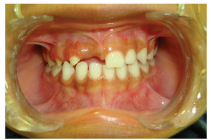
Figure 4. Picture of the histological cross-section of tooth 51, showing calcification of the pulp tissue and disorganized dentin.