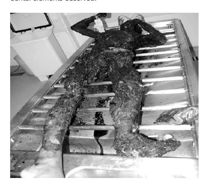
Figure 1. Carbonized Body IML-SP (October, 2008).

The radiographic image (Figure 4) emphasized the following peculiarities: The radiolucent area on the distal surface of the crown of tooth 15, compatible with caries; solution of continuity with loss of substance in the mesial cervical portion; positioning, coronal morphology, conformation of the pulp chamber and singular shape of the root canal (bifurcation of the canal as from the middle third of the root); radiolucent area, compatible with caries, on the mesial and occlusal surfaces of tooth 16, extending from the pulp chamber and cervical third of the root canals; solution of continuity with loss of substance in the cervical third of the distal root; positioning, anatomic conformation of the crown, roots and root canals; positioning, coronal morphology, conformation of the pulp chamber and root canals of element 17; positioning, anatomic conformation of the crown, roots and root canals; positioning, coronal morphology, conformation of the pulp chamber and root canals of element 18, presence of image compatible with calculus on the cervical portion of the mesial face of the crown; horizontal bone loss pattern, affecting elements 18, 17, 16 and 15; vertical bone loss pattern on the mesial interproximal surface of tooth 15 and adjacent, and anatomy of the maxillary sinus cortical (extension to alveolar area) and its relationship with the roots of the dental elements observed.