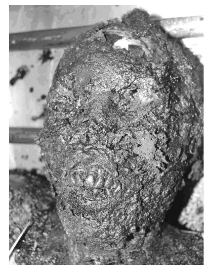
Figure 2. Detail of face of carbonized body IML-SP. (October, 2008).

of root canals) of tooth 16, submitted to necropulpectomy, according to the record chart sent (Figures 4 and 6) and coincidence with regard to the presence of restoration with temporary cement in tooth 27 of the cadaver, compatible with emergency endodontic treatment performed in the patient.