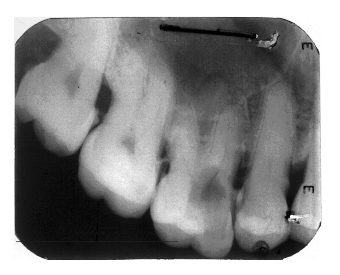
Figure 4. Radiograph taken at urgency service of Dental Teaching Institute (antemortem information).