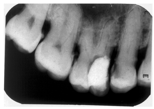
Figure 6. Radiograph taken at urgency service of Dental Teaching Institute (antemortem information).