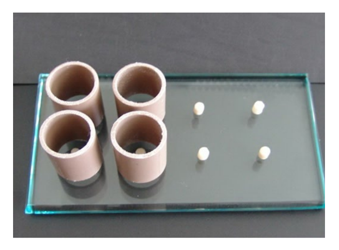
Figure 3. PVC cylinders positioned for filling with acrylic resin.