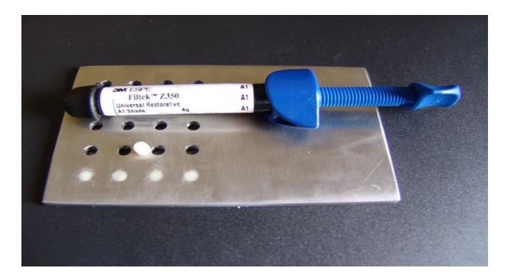
Figure 2. Matrix for construction of the composite resin discs.