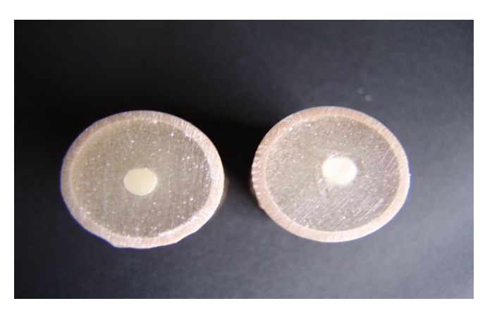
Figure 4. PVC cylinders positioned for filling with acrylic resin.