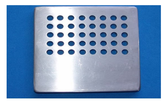
Figure 1. Matrix for construction of the ceramic discs.

Lab, situated in the town of Chapecó (SC). The composite resin specimens were made at a private dental practice in Chapecó (SC), using stainless steel matrices (Figure 2). One side of the ceramic discs was glued to a glass plate using an instant universal adhesive. Thirty sections of PVC pipe (Tigre, Sao Paulo, Brazil) were prepared, measuring 2.5 cm in diameter and 3 cm in height, and positioned over each sample (Figure 3) and stabilized onto a glass plate using utility wax. Acrylic resin was prepared according to the manufacturers instructions, mixing powder and liquid in a glass receptacle using a spatula until complete homogenization. The mixture was then poured into the PVC tubes until full. Complete polymerization was achieved within 10 minutes. The entire test set was removed from the glass plate and filed down using sandpaper (3M, Sumaré, Brasil) in order to reduce abrasiveness. Initially, a 400-grade sandpaper was used to remove excess acrylic resin from the ceramic surface, followed by 600 to obtain a flat, smooth surface (Figure 4). The cylinders were rinsed under running water to remove the remaining particles of powder and then analyzed using a magnifying glass (4x magnification), to confirm cleanliness of the ceramic.